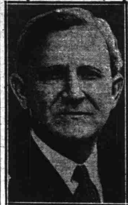
"Texas will turn the tide" said Senator Morris Sheppard (above) author of the 18th amendment as he left Washington to direct the fight against the repeal amendment on which the Lone Star State will vote August 26th.