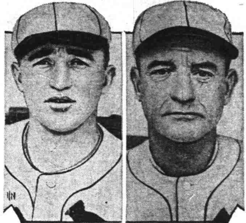
Frankie Frisch (left) and Gabby Street, whom Frisch, star second baseman of the St. Louis Cardinals, succeeded as manager of the team.