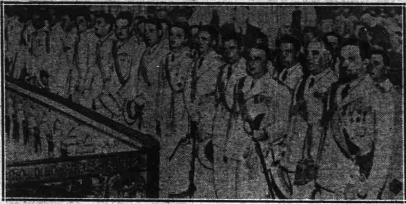
With their leader, General Italo Balbo, these pilots of the Cathedral, Chicago. The Pope called his Italy's great air armada, are shown as they attended a special mass of thanksgiving at Holy Name native land.