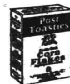
THE WAKE-UP FOOD