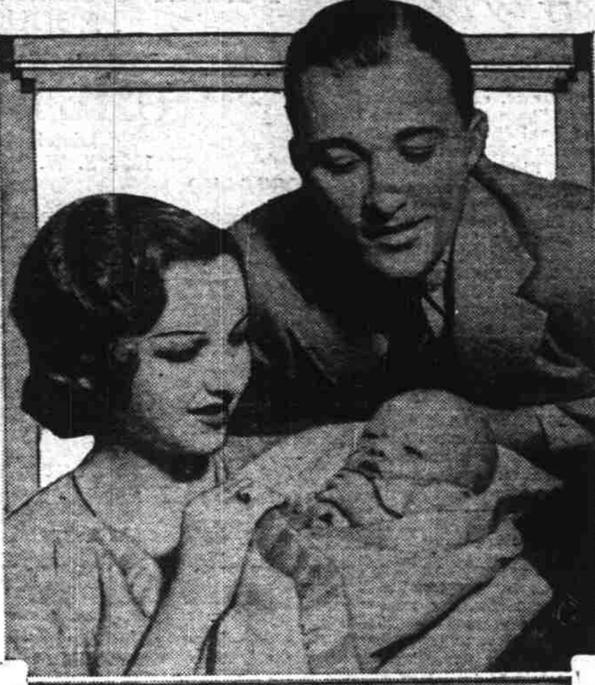
Meet the Crosby family, Bing of radio, stage and screen fame, Mrs. Bing, the former Dixie Lee of the films, and Baby Bing, who was just three weeks old when this picture was made in Hollywood. The little fellow has been named Gary Evan Crosby.