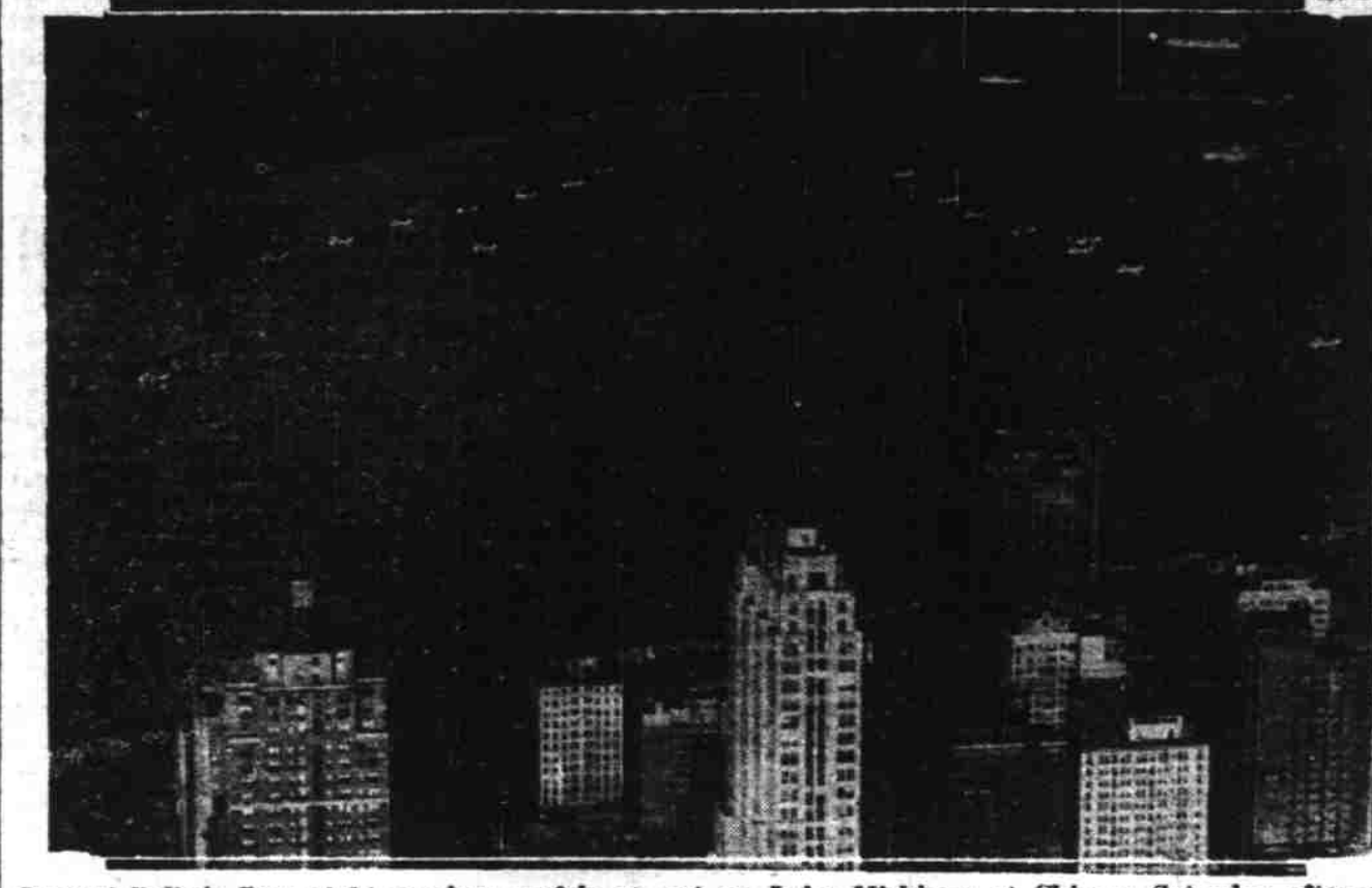
General Balbo's fleet of 24 seaplanes safely at rest on Lake Michigan at Chicago Saturday afternoon The Italians, who left their homeland June 30, had finished what is regarded as the greatest mass flight in aviation history.