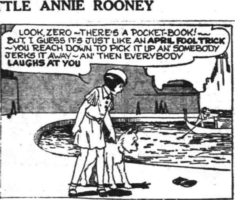
By DARRELL McCLURE