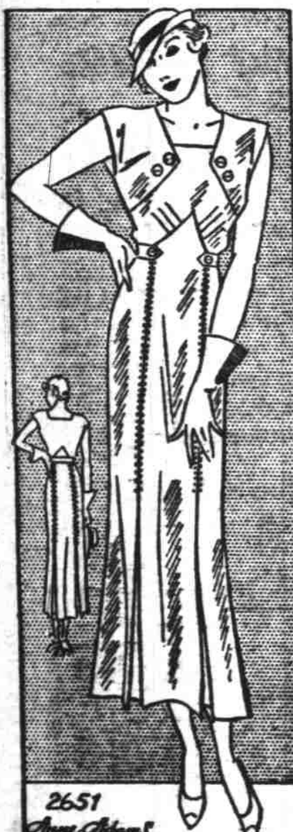
By ANNE ADAMS

The sweltering weather is here to stay! Even if you have enough cool, cotton frocks to carry you through the season in comfort, there's always room for one more. We've never seen smarter lines than these... forming the jacket-like bodice, the slender skirt panels and the semi-belted waistline! A few perky buttons and top-stitching are noteworthy, too. Pattern 2651 may be ordered only in sizes 14, 16, 18, 20, 22, 24, 26, 28 and 30. Size 16 requires 3 1/2 yards 36-inch fabric. Illustrated step-by-step sewing instructions included.