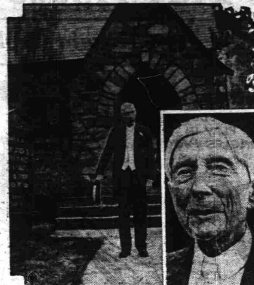
Straw hat in hand, John D. Rockefeller, Sr., obligingly poses for the camera as he left the Union Church at Pocantico Hills, N. Y., after attending services on the day following his 94th birthday. Inset is an excellent closeup of the oil magnate, who carries his years in remarkable fashion.