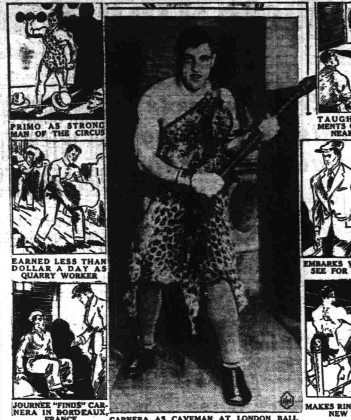
PRIMO AS STRONG MAN OF THE CIRCUS