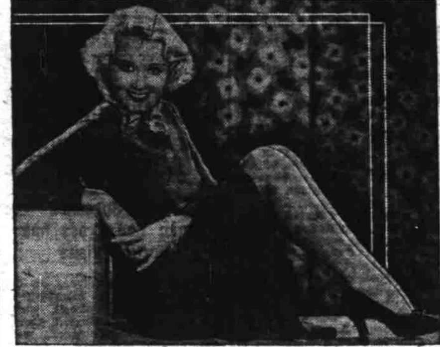
Joan Blondell in a shot from "Lawyer Man" which will be featured at the Hollywood Wednesday.