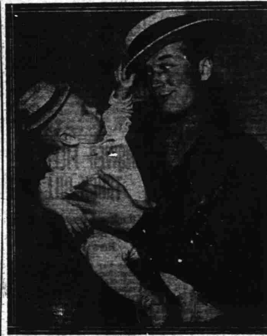
Maurice Chevalier and his picture infant as he appears in a scene from "Bedtime Story" now at the Elsinore.