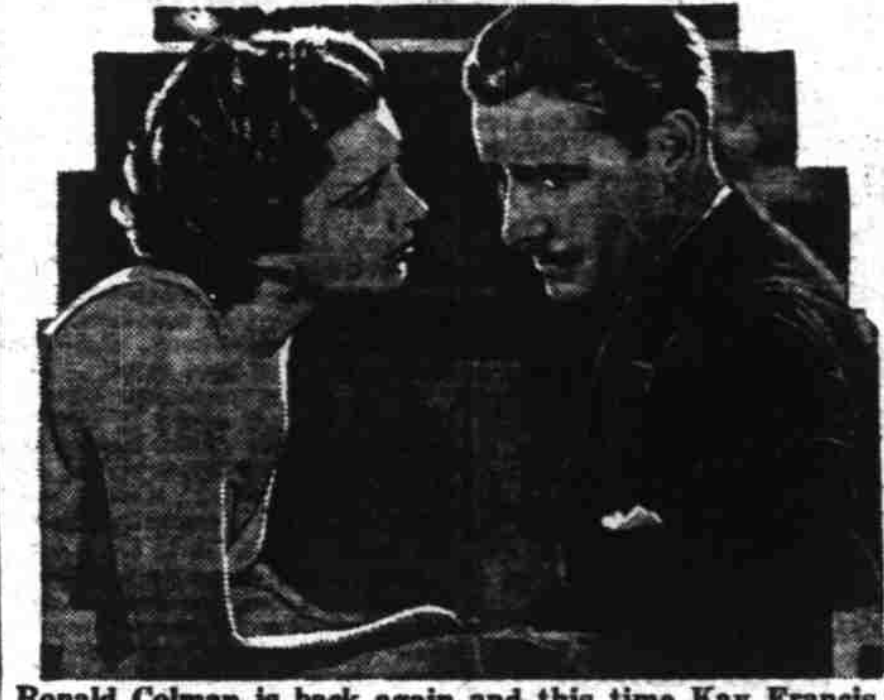
Ronald Colman is back again and this time Kay Francis is his foil in the picture "Cynara" now showing at the Grand.