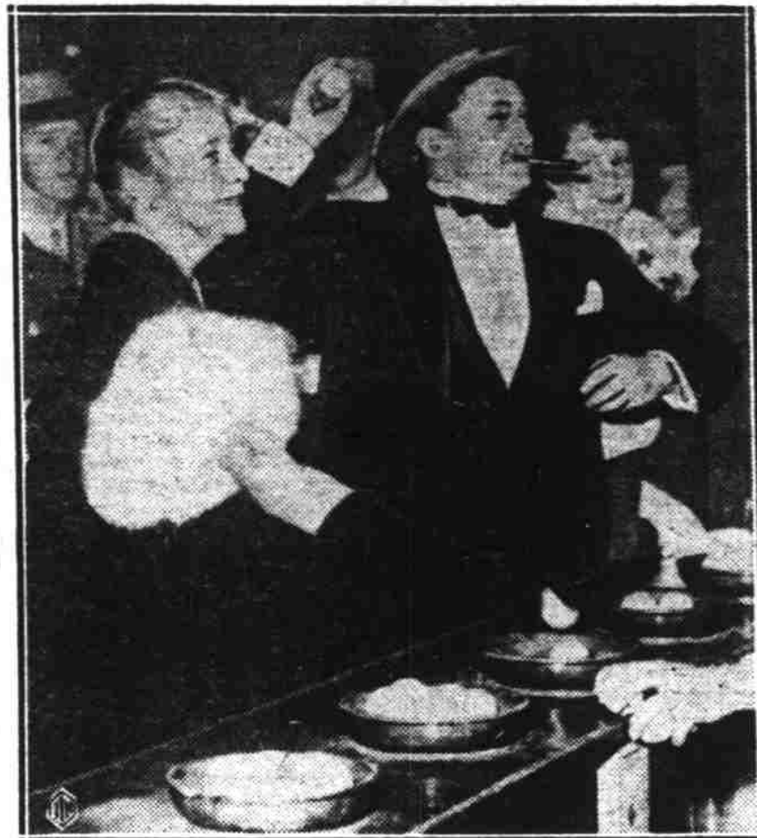
All work and no play makes Jack, or Jill, a dull boy or girl, so Mrs. Ruth Bryan Owen, U. S. Minister to Denmark, relaxes at Copenhagen's amusement park. She is shown trying her marksmanship at the "firing kitchen." Beside the lady envoy is Jean Hersholt, well-known actor.