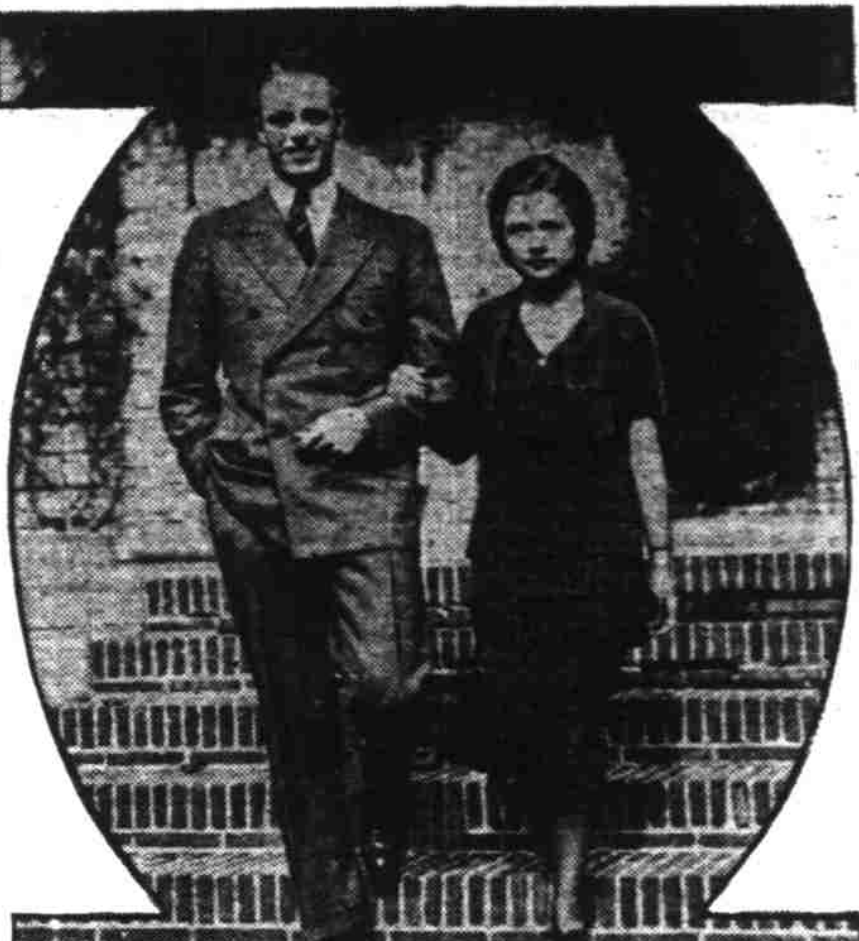
Elliot Roosevelt, second son of the President, and his wife, the former Elizabeth Browning Donner, whose marital barque has come to grief on the rocks of incompatibility. Young Roosevelt is establishing a legal residence in Nevada in order that his wife may divorce him, it was recently revealed.

Farmer Union Will Hold State Picnic At Carlton Today