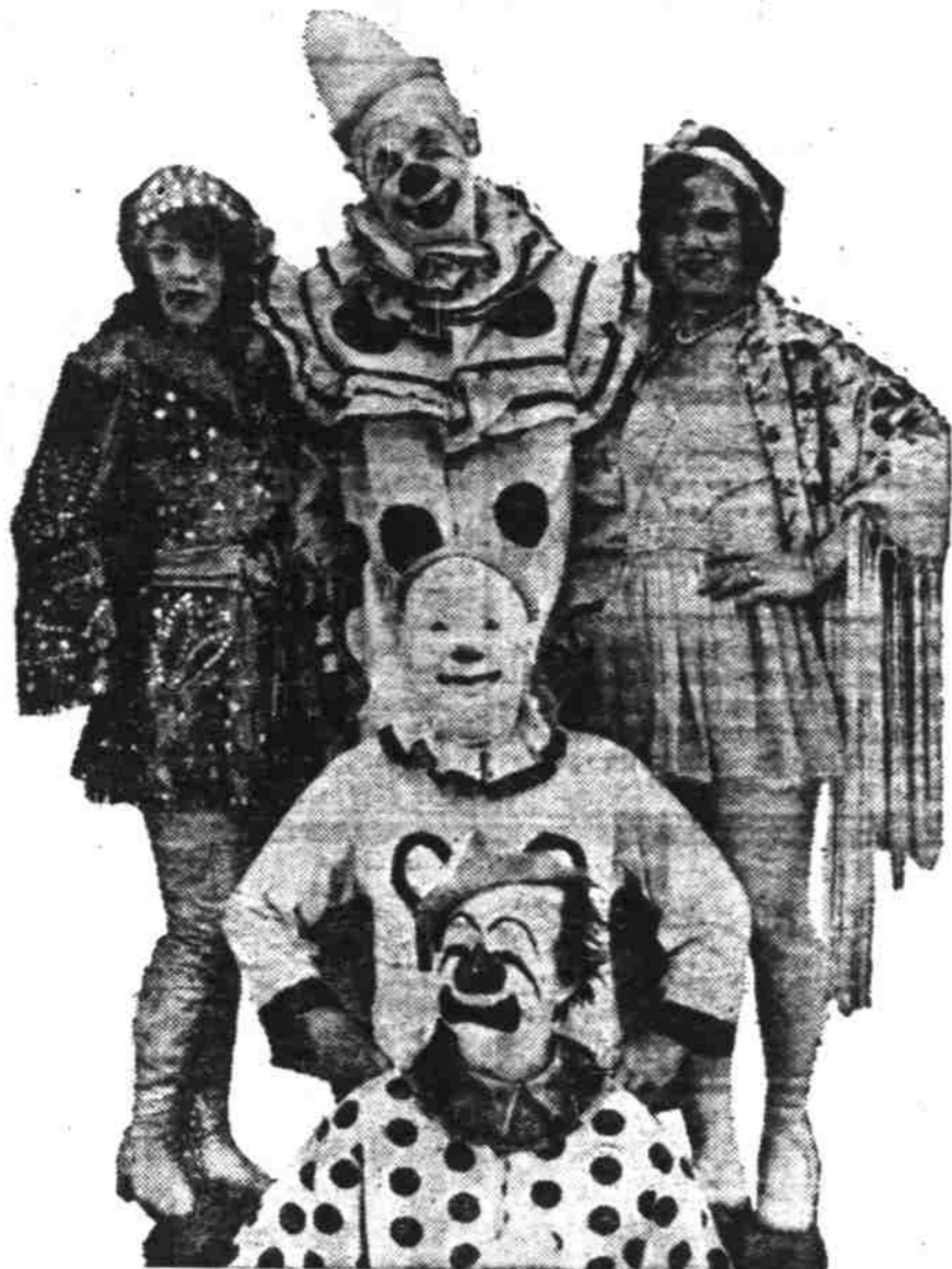
Here is the Potter troupe of clowns, just five among the 60 carried by the Al G. Barnes circus which comes here Saturday, June 24.