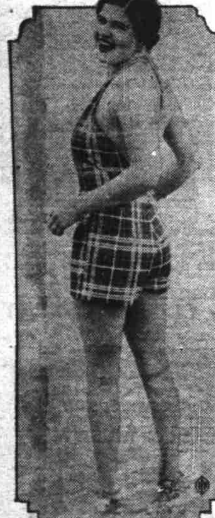
Once upon a time gingham was associated only with farm lassies, but now it has crept into the select circle over which Dame Fashion presides. Here is something novel in gingham. It is a bathing suit of the material which recently made its appearance at Lido Beach, L. I.