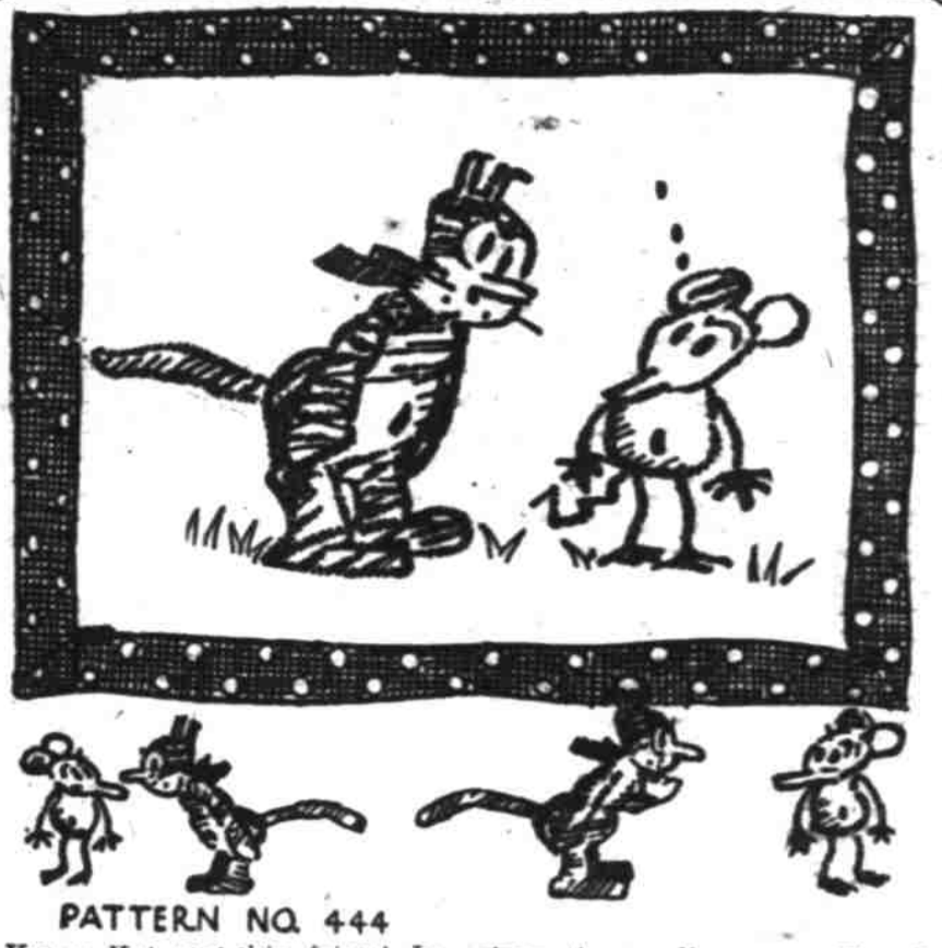
PATTERN NO. 444

Krazy Kat and 'his friend Ignatz, the mouse, are with us in this pattern. Their astonished and bewildered expressions have been caught in these simple embroidery designs that will make an attractive pillow, crib cover motif, motifs for children's clothes, or a decoration on accessories for the nursery. These droll figures have long been beloved by children and grown-ups everywhere, and this occasion to embroider them yourself is the first such opportunity given the needlewoman.