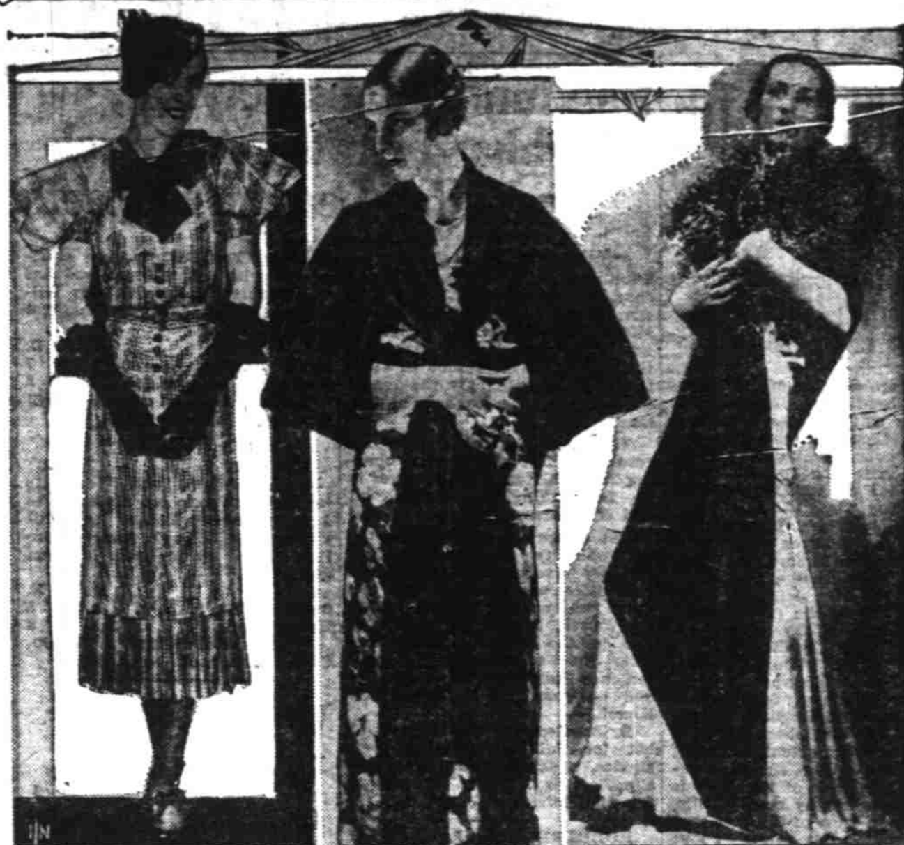
Never has there been allowed more latitude in choosing clothes than is permitted milady this season, for almost anything is permissible—provided it is perfectly done and in good taste. Figue, cotton, silks or velvets are in order at any time as long as they are correctly styled with harmonious details. Above are three models of the latest creations to come from the designer's table. At left is a white taffeta afternoon dress, with new draps puff sleeves and plated foundation under the bust. The collar, jabot and top of sleeves are of black transparent velvet. In center is a bottle green velvet wrap with the new draped scarf from the scarf yoke over the mousseline print with dark green background. At right is a dark green velvet scarf wrap with fancy ostrich trim. White dots are pasted on the ends of the ostrich fur which have been waxed.