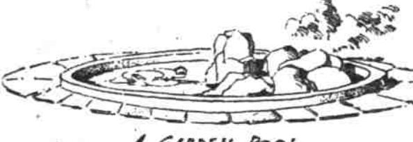
A GARDEN POOL.

A garden is not complete without water in some pronounced form. It may be a rippling brook, but rarely is such a boon available for the average city garden. A pool of any size too, is a luxury, but there are splendid possibilities in the medium sized pools which offer an accessible addition to most any garden. Completed they look formidable to possess to the amateur gardener, but a little investigation will prove that to have one is quite possible. Easily available information may be had by addressing the Universal plan in care of The Statesman.