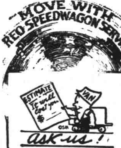
MOVE WITH RED SPEEDWAGON SERVICE

OUR CERTAIN-TEED ROOFS Can take it, they're Millerized. Let us give you a free estimate. Salem Paint & Roofing Co. We Guarantee Satisfaction 474 Ferry St.