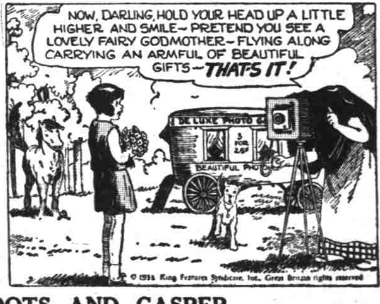
By DARRELL McCLURE