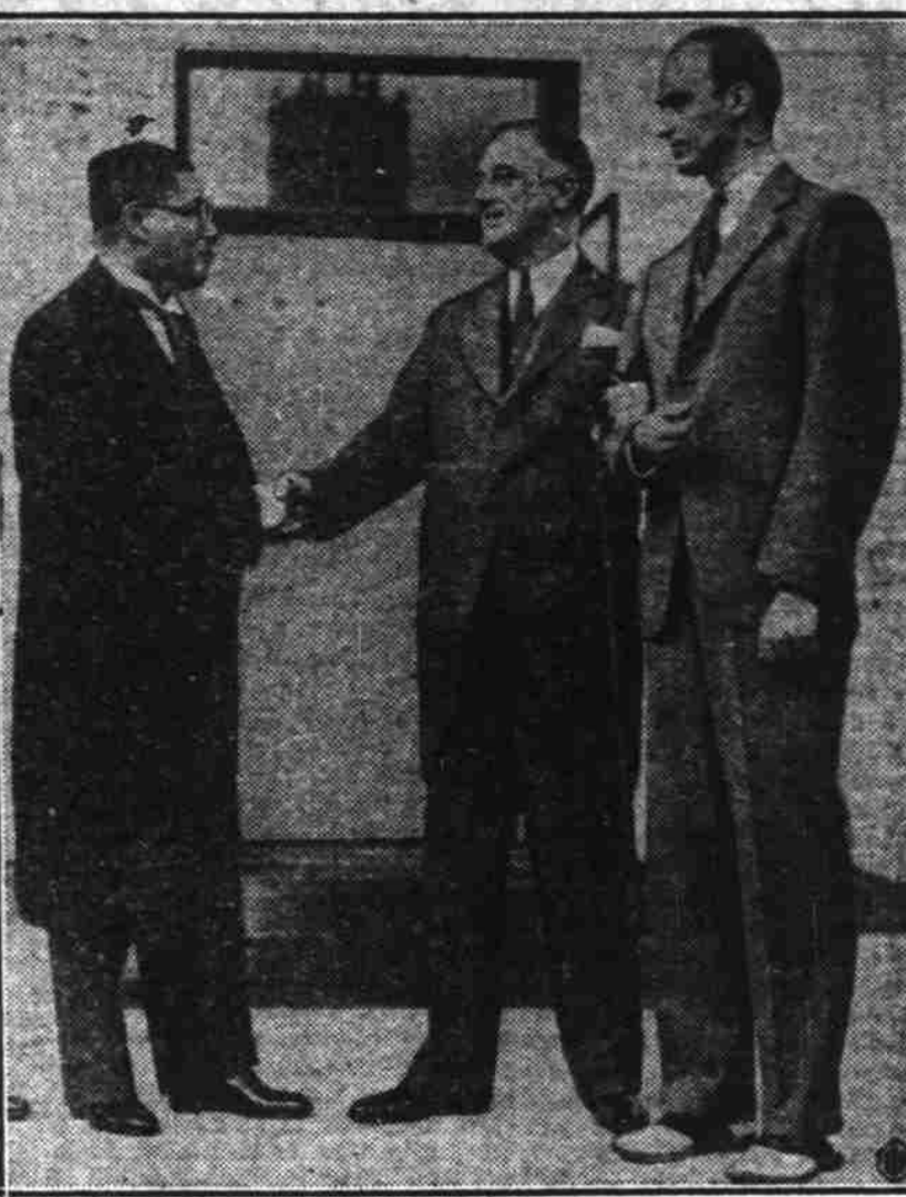
President Roosevelt on the portico of the White House extends a warm handshake of friendship to T. V. Soong, Chinese Finance Minister and his country's delegate to the economic parleys at Washington.