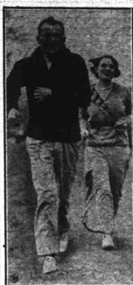
Accompanied by his wife, who is also serving as his trainer, Seaman Tom Watson, British featherweight champion, is pictured doing his roadwork around his training camp at Pompton Lakes, N. J. He is getting in shape for his coming title bout with Kid Chocolate, Cuban Bon-bon, for the world's featherweight crown.