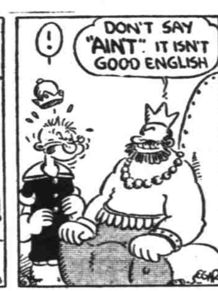
By DARRELL McCLURE