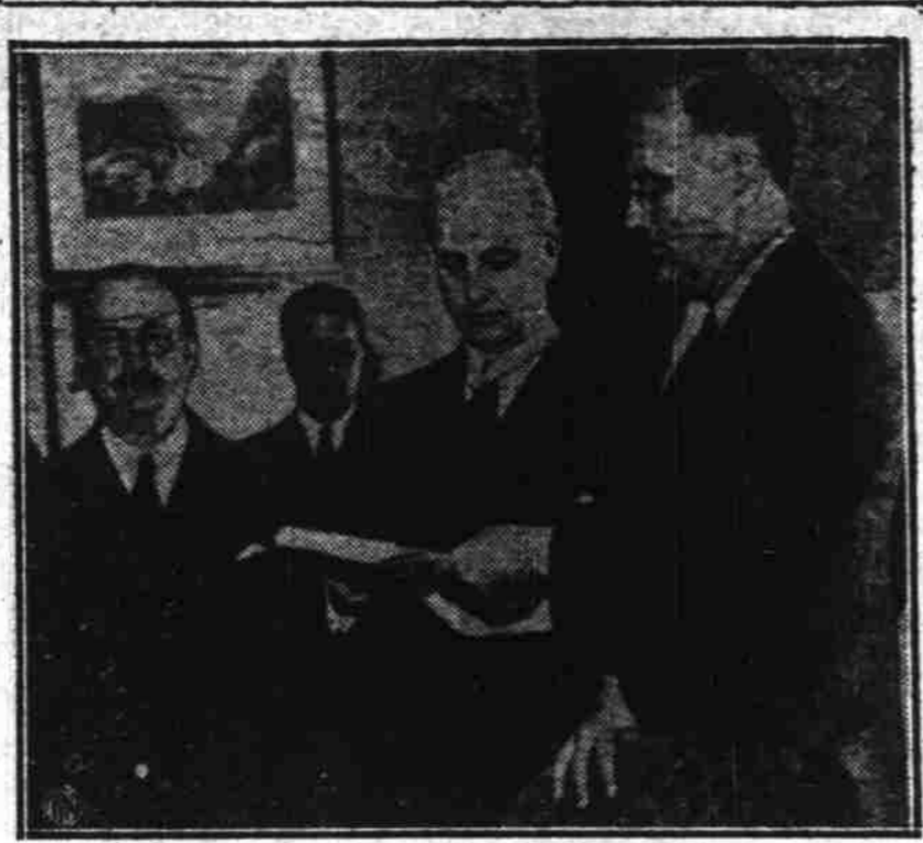
Thirty-five years after he had sunk the collier Merrimac across the mouth of Santiago Harbor during the Spanish-American War, Richard Pearson Hobson is here shown as he was decorated with the highest award in the gift of the nation for his heroism. President Roosevelt is shown as he presented the gallant officer with the Congressional Medal of Honor. At left is Assistant Secretary of the Navy Henry Roosevelt.