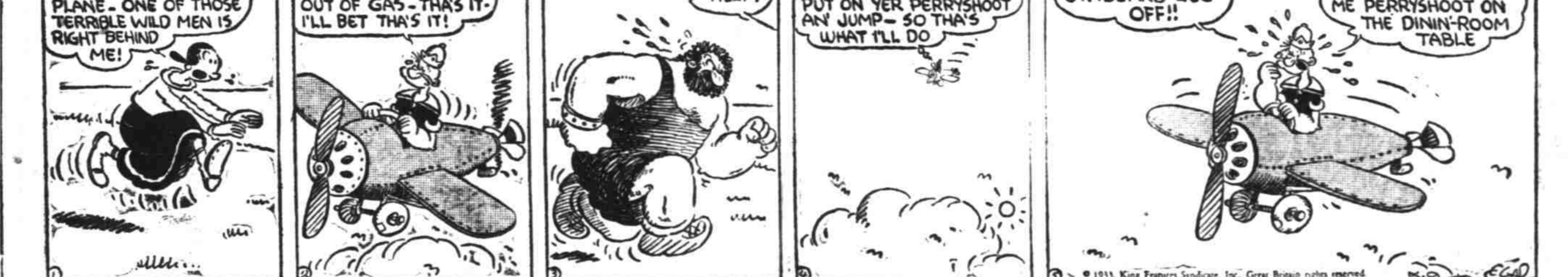
Now Showing—"Just a Little Blue Bird" By SEGAR