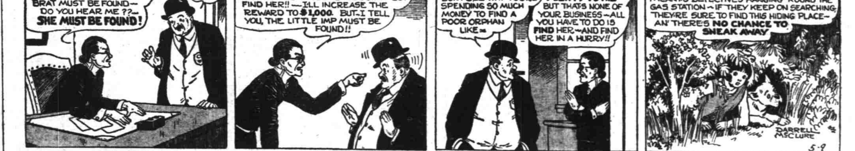
"Such Popularity Must Be Deserved" By DARRELL McCLURE