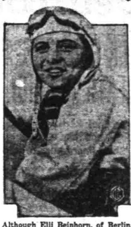
Although Elli Beinhorn, of Berlin, could win laurels with her beauty in any bathing belle competition, she chose instead to seek fame in the air. She is shown here after she was awarded the Hindenburg Cup for outstanding flying feats with a light motorized craft. The trophy is one of the most highly prized among German fliers.