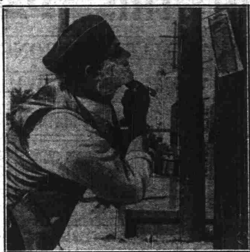
Reminiscent of active service in La Belle France during the Big Parade is this picture of an American Legionnaire shaving in a ruined street of Long Beach, Cal., while on volunteer duty after the earthquake. The Legion responded nobly to the call of the distressed victims, serving in hundreds of capacities, from directing traffic to feeding and sheltering the homeless.