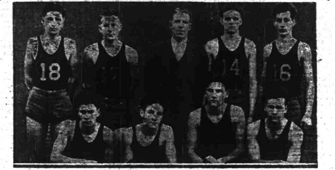
Benson Tech of Portland sent a well-balanced, capable quintet to the state tournament, but it had the misfortune to run against Salem in the first round and came off second best, later defeating Klamath Falls and losing to Silverton in a close game in the left bracket.