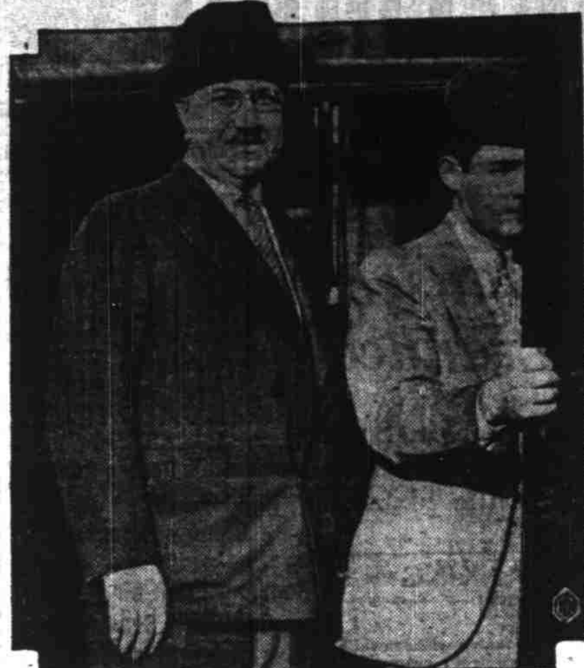
Governor Henry Horner of Illinois is pictured on his arrival at Miami, Fla., following a hurried dash from Chicago to the bedside of Mayor Anton Cermak of Chicago. The Governor was permitted to see Mayor Cermak, who though still in a serious condition, is believed to be making headway in his fight against the effects of the wound he sustained when an assassin attempted the life of President-elect Roosevelt.