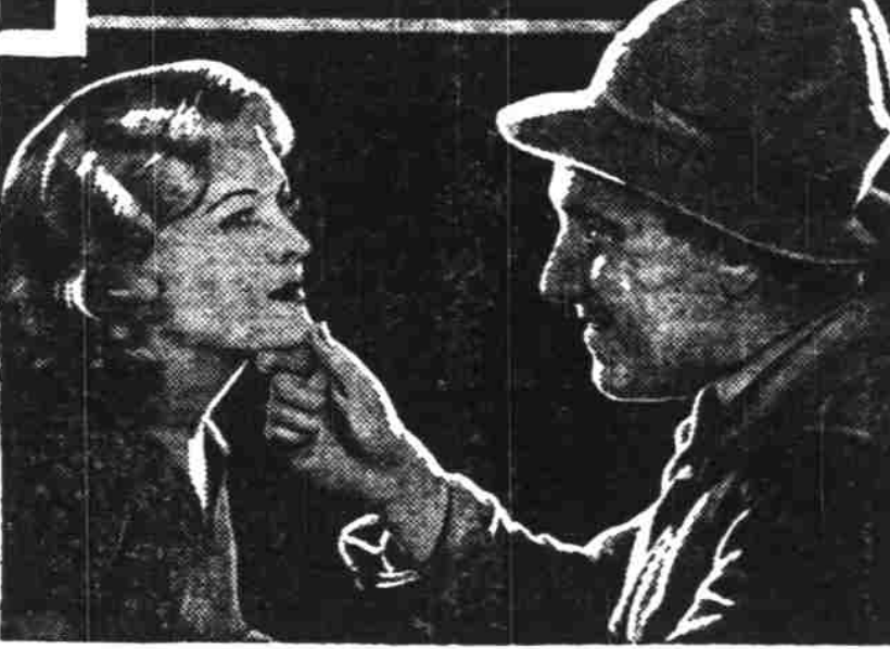
Marion Nixon and Spencer Tracy in the film feature, "Face in the Sky" now showing at the Grand.