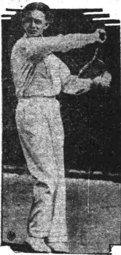
Jack Crawford, Australian tennis star, who successfully defended his championship of "Down Under" against Keith Gledhill, American ace, at Melbourne. In the preceding rounds Gledhill had vanquished McGrath of Australia, who had beaten Ellsworth Vines, American singles champion. Crawford won 2-1, 7-5, 6-2.

school authorities have been busy combatting this rumor. The price of admission will be quite low, although the exact sum was not known here Tuesday. Silverton high school is also slated to play Lebanon here Friday night and a large number of fans are expected out to see the boys in their final game before the big clash Saturday night.