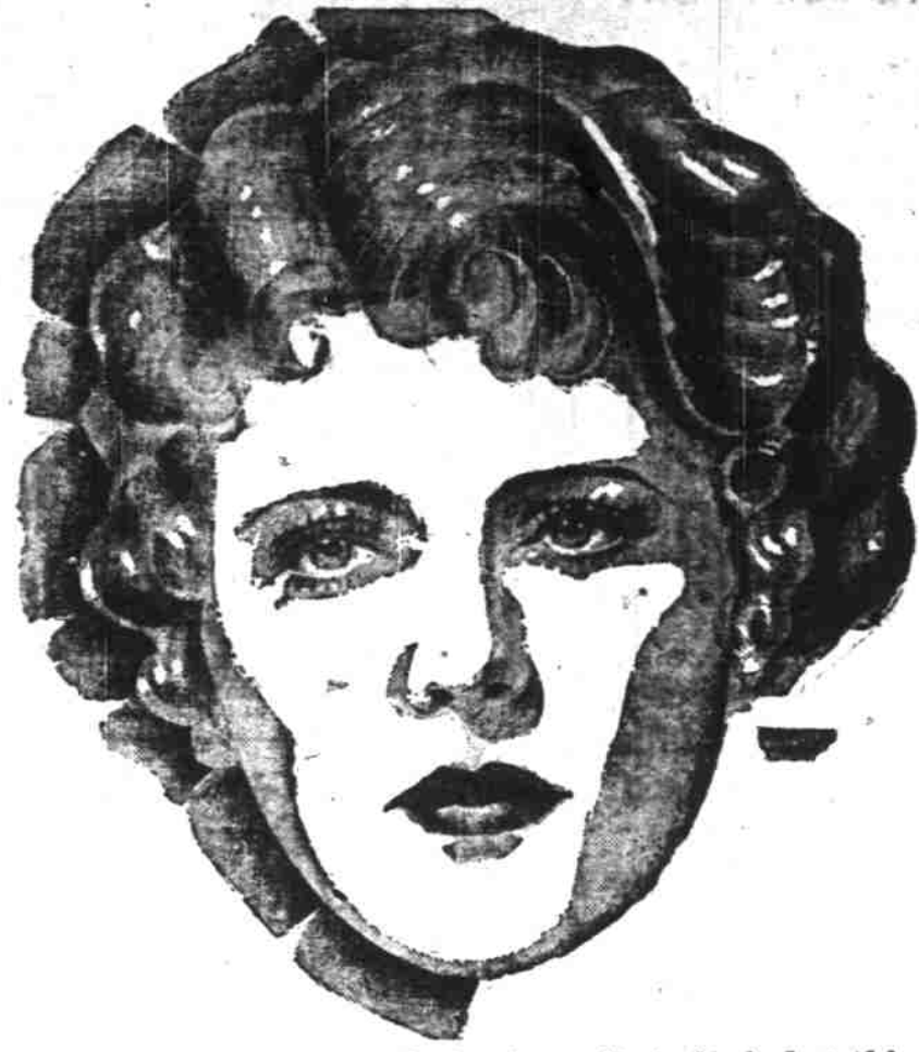
Hardly looks like the finished actress that she is but this is what Ruth Chatterton does to herself in her latest attraction in Salem, "Frisko Jenny," now showing at the Elsinore.