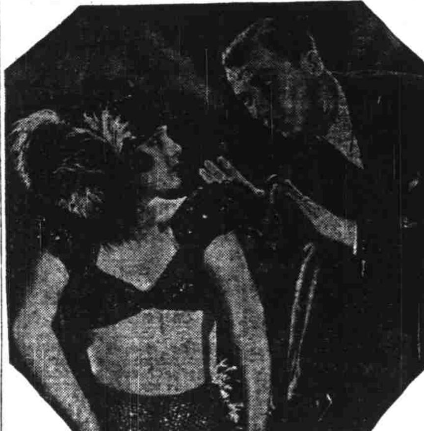
None other than the ambitious newspaper man, Lee Tracy, and his latest attraction, Lupe Velez, as they appear in "The Half Naked Truth" at the Capitol today.