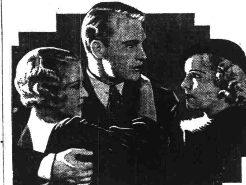
Sally Eilers, Ralph Bellamy and Helen Vinson in "Second Hand Wife", story by Kathleen Norris, and now showing at the Grand.