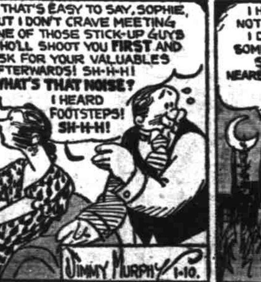
I HEARD FOOTSTEPS, AND IT'S CANIT NOT IMAGINATION, EITHER! I DON'T SEE ANYONE BUT SOMETHING TELLS ME THAT SOMEBODY IS LURKING EARSY AND I'M BEING WATCHED GOSH, IT'S A C-CREEPY FEELING