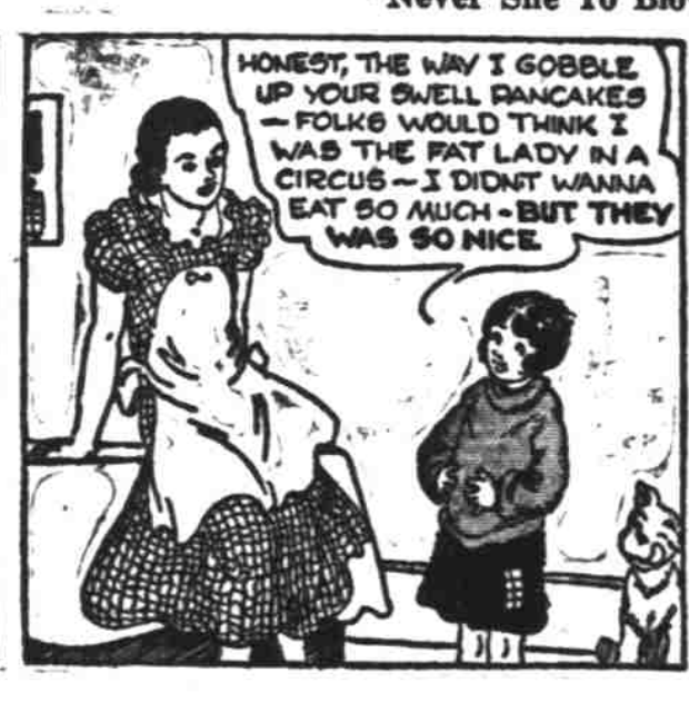
"Never She To Blow Her Own Horn"

LE'S PULL OFF A THAT'S A SPLENDID LET THE PEOPLE IDEA!