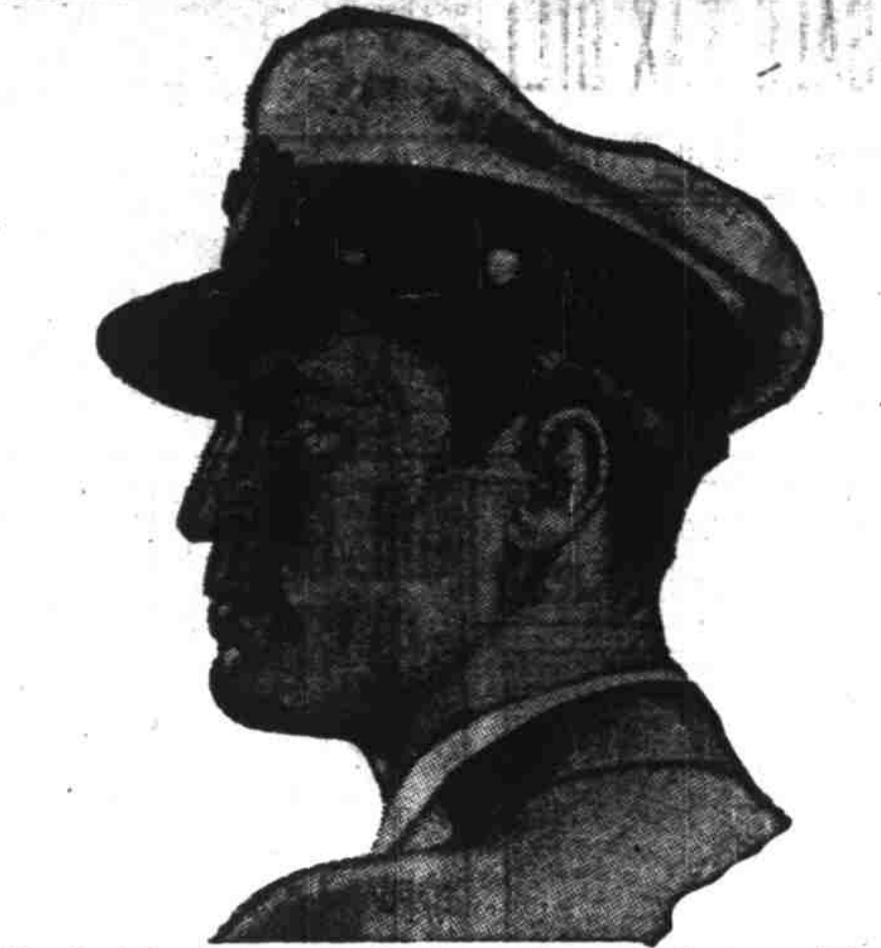
Chester Morris in a dignified pose from the feature picture "Corsair" now the stellar attraction at the Hollywood.