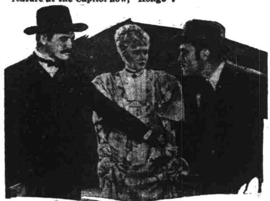
Richard Dix and Ann Harding from one of the picture classics of the year, "The Conquerors" now showing at the Elsinore.