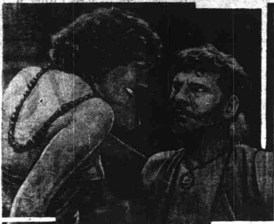
Lupe Velez and Walter Huston in the bristling with thrills feature at the Capitol now, "Kongo".

"Kongo," Metro-Goldwyn-Mayer's drama of mystery and thrills in the African jungle, opens today at the Capitol theatre. As "Kongo" stars Virginia Bruce, who recently became the wife of John Gilbert, is the white girl to be sacrificed. Conrad Nagel is the dervish Englishman, a doctor, who seeks to save her.