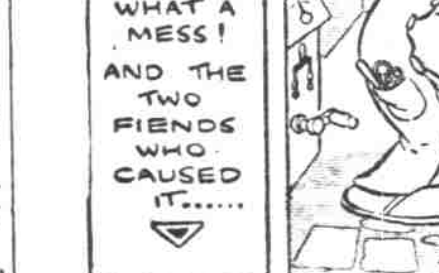
THIMBLE THEATRE—Starring Popeye