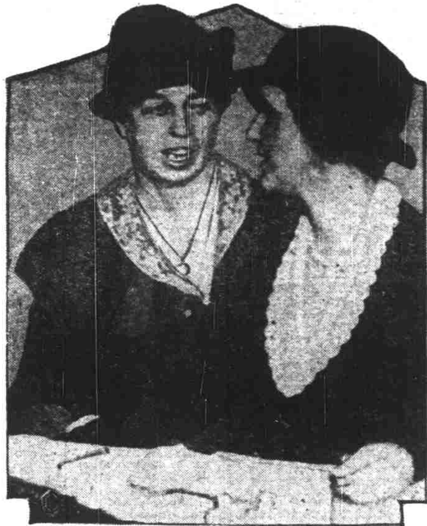
LADY NANCY ASTOR, American born and now British parliament member, talks things over with Mrs. Franklin D. Roosevelt, soon-to-be "first lady of the land."