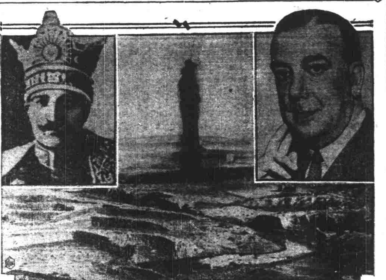
SHAH OF PERSIA — GUSHER ON PERSIAN OIL FIELDS — SIR JOHN CADMAN

In a note to the British Government, "so offensive" that it could not be published, the Shah of Persia has defied Great Britain to do its darndest over the Persian Government's recent drastic action in cancelling the oil leases of the Anglo-Persian Oil Company. The Shah intimated that if Britain makes a show of force it will take but a few well-aimed Persian shells to send millions of pounds worth of British oil property up in smoke. Sir John Cadman, chairman of the Anglo-Persian Company, challenges the legality of Persia's action, asserting that it constitutes a grave breach of contract and lays the whole trouble to the falling off of royalties paid to the Persian Government, due to the depression. The Shah says that royalties have nothing to do with the cancellation of the concessions, but bases his country's case on arrears of royalties, going back to 1905, which, he claims, the British company has wrongfully withheld from Persia. Meanwhile, Russia is busy to the effect that Soviet Russian influence is responsible for the trouble. It is known that the Soviet has been desirous of acquiring the valuable oil concessions held by Britain and had offered every possible inducement to Persia to terminate the agreement and so secure the oil wells for itself.