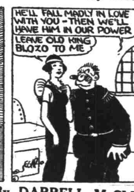
By DARRELL McCLURE