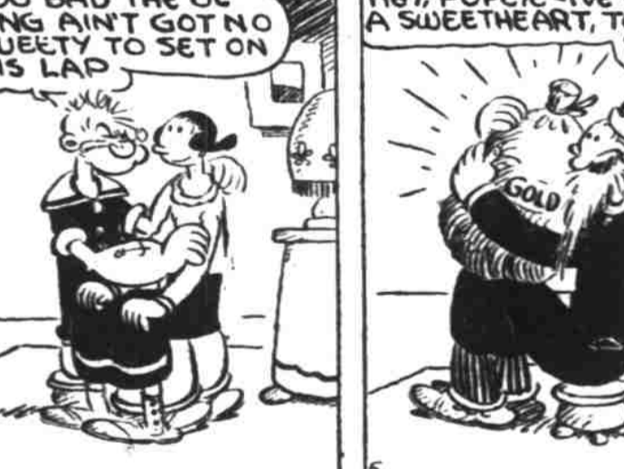
By DARRELL McCLURE