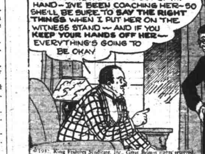
TOOTS AND CASPER