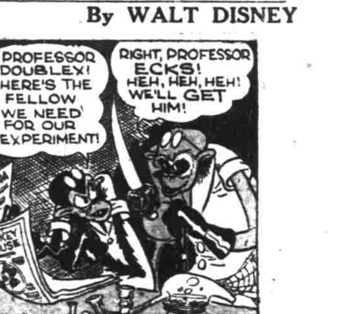
By WALT DISNEY