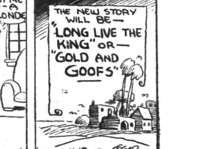
By DARRELL McCLURE