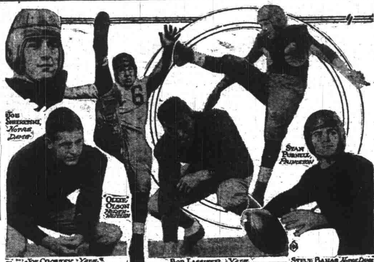
The Yale-Princeton game at Princeton and the Notre Dame-Northwestern clash at South Bend, Ind., are the most important of this Saturday's gridiron meetings. The Ramblers meet a strong opponent in Dick Hanley's Wildcats who held Notre Dame to a scoreless tie last year. The Eli eleven meets Fritz Crisler's strong Tigwe squad in the first of the clashes between the Big Three and winds up Princeton's schedule.