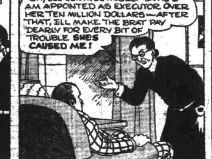
"More Than Colonel Hooper Bargained For"