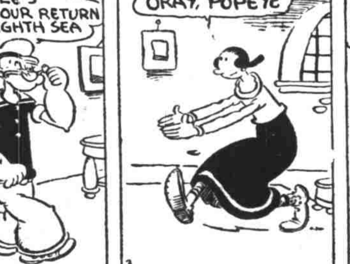
"A Woman's Intuition"