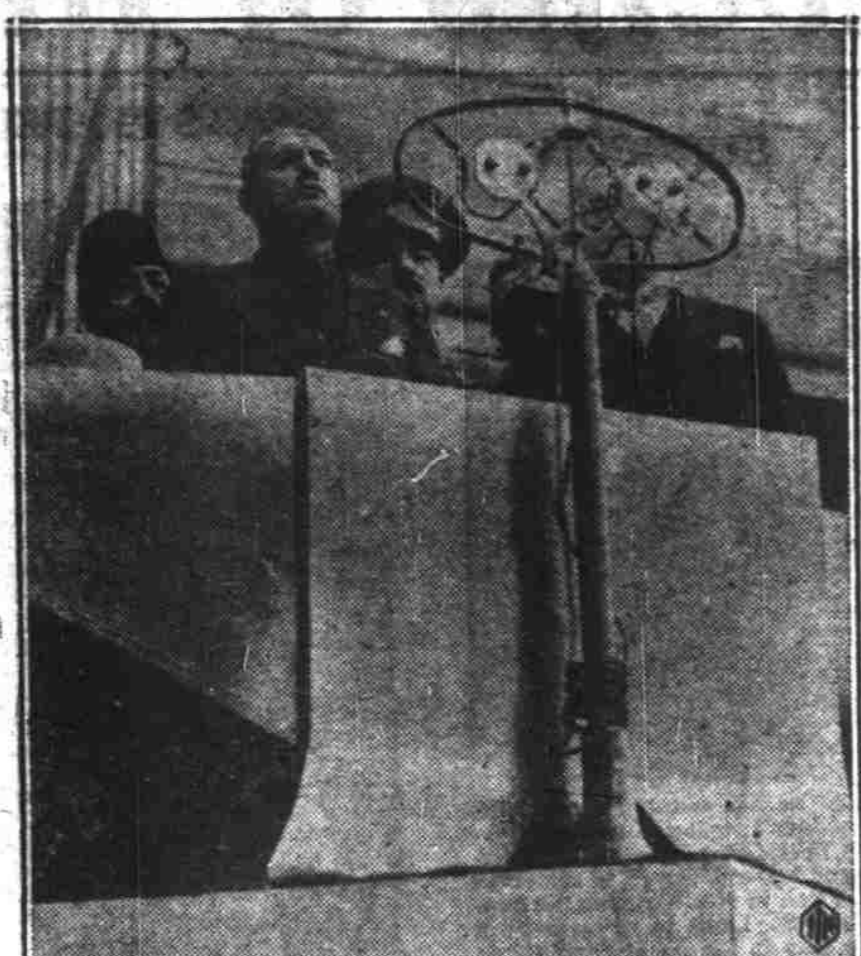
Premier Benito Mussolini of Italy is shown before the microphones as he addressed a huge gathering of workmen at Turin during the recent anniversary celebrations of the progress of the Fascist movement. Although Turin is regarded as a stronghold of anti-Fascism, Il Duce received a tremendous ovation.