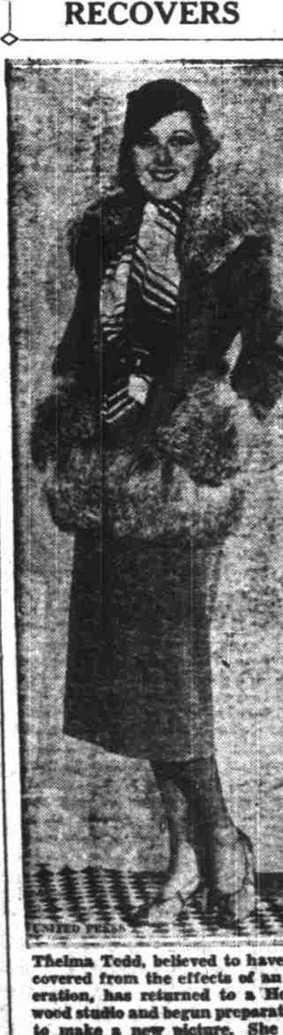
Thelma Todd, believed to have recovered from the effects of an operation, has returned to a Hollywood studio and begun preparations to make a new picture. She was critically ill for some time.