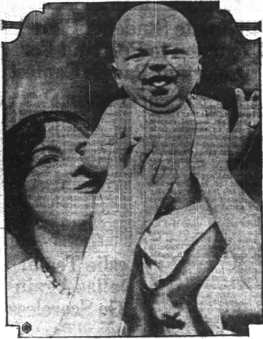
The photographer didn't have to tell this young man to look at any birds to make him smile. The little fellow was tickled silly to strut his stuff for the camera.