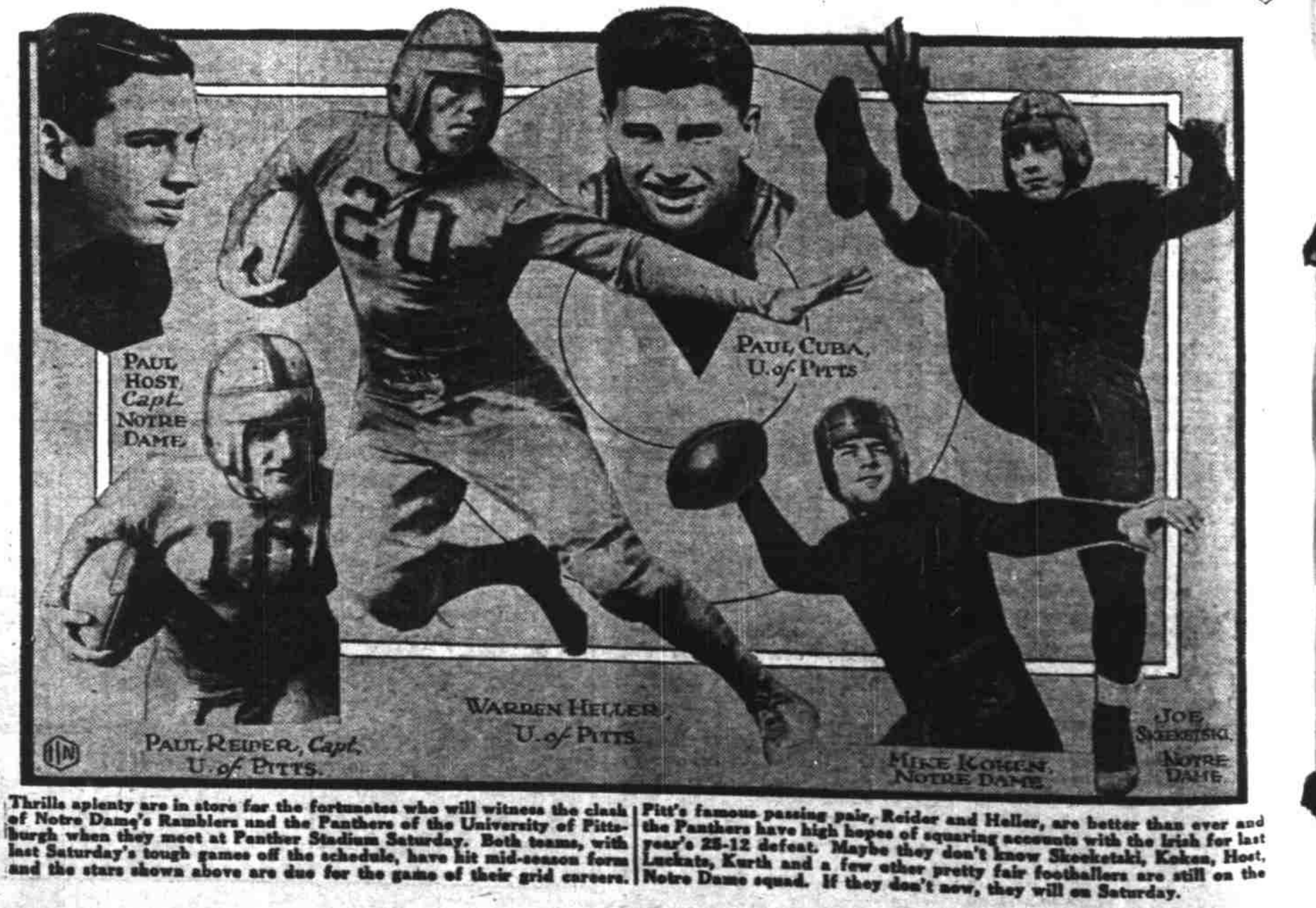
Thrills aplenty are in store for the fortunes who will witness the clash of Notre Dame's Ramblers and the Panthers of the University of Pittsburgh when they meet at Panther Stadium Saturday.

THRILLS aplenty are in store for the fortunes who will witness the clash of Notre Dame's Ramblers and the Panthers of the University of Pittsburgh when they meet at Panther Stadium Saturday.