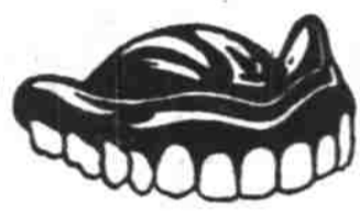
MY PLATES REALLY STICK

BEST Rubber PLATE Cool, flexible, comfortable Now Only $12.50