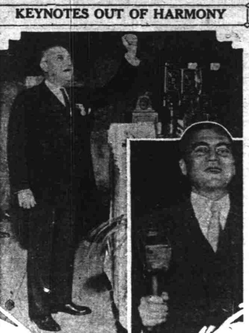
Senator Robert Wagner, pictured as he made the keynote speech at the New York State Democratic Convention in Albany, N. Y. His address consisted mainly of a denunciation of "Hoover Republicanism." At right is Hamilton Fish, Jr., who is shown as he keynoted for the State G. O. P. Convention at Buffalo.

INDEPENDENCE, Oct. 18.—Local politics are increasing in interest, following a meeting of citizens, when the following were nominated for city offices: