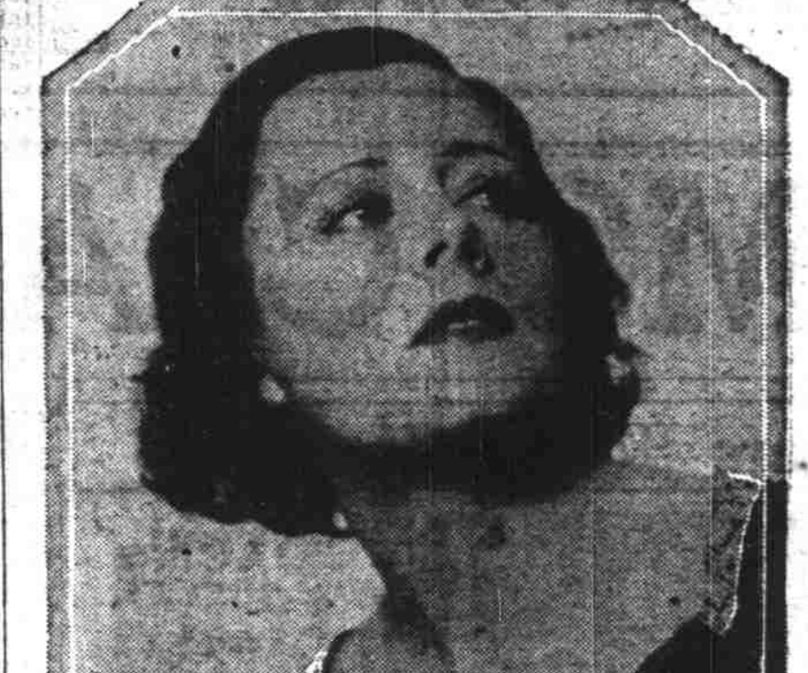
An attractive pose of Irene Dunn in Fanny Hurst's novel in picture "Back Street" now showing at the Elsinore.

be sure you get Kruschen - your | theatrical center of New York, health comes first and remember and much of the action deals this if you are not joyfully satis- with backstage life.