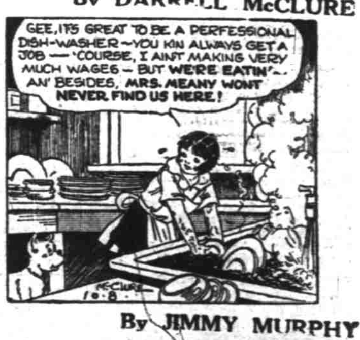
"A Man With a Future"

THE LITTLE KID MUST HAVE KNOWN THAT OLD GLOAS GOT HIS INFORMATION HERE IN ARKVILLE -- SHE WOULDN'T COME HERE!! ~ I DON'T LIKE THE LOOKS OF MRS MEANY - BUT SHE HAS PROOF SHE'S THE CHILD'S GUARDIAN --- MAYBE IT'S MY DUTY TO TELL HER-WHERE I THINKS