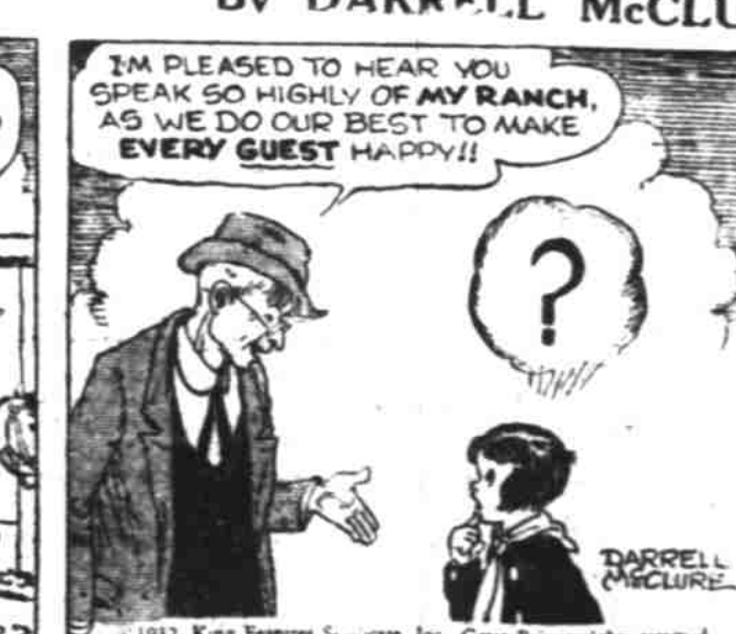
By DARRELL McCLURE