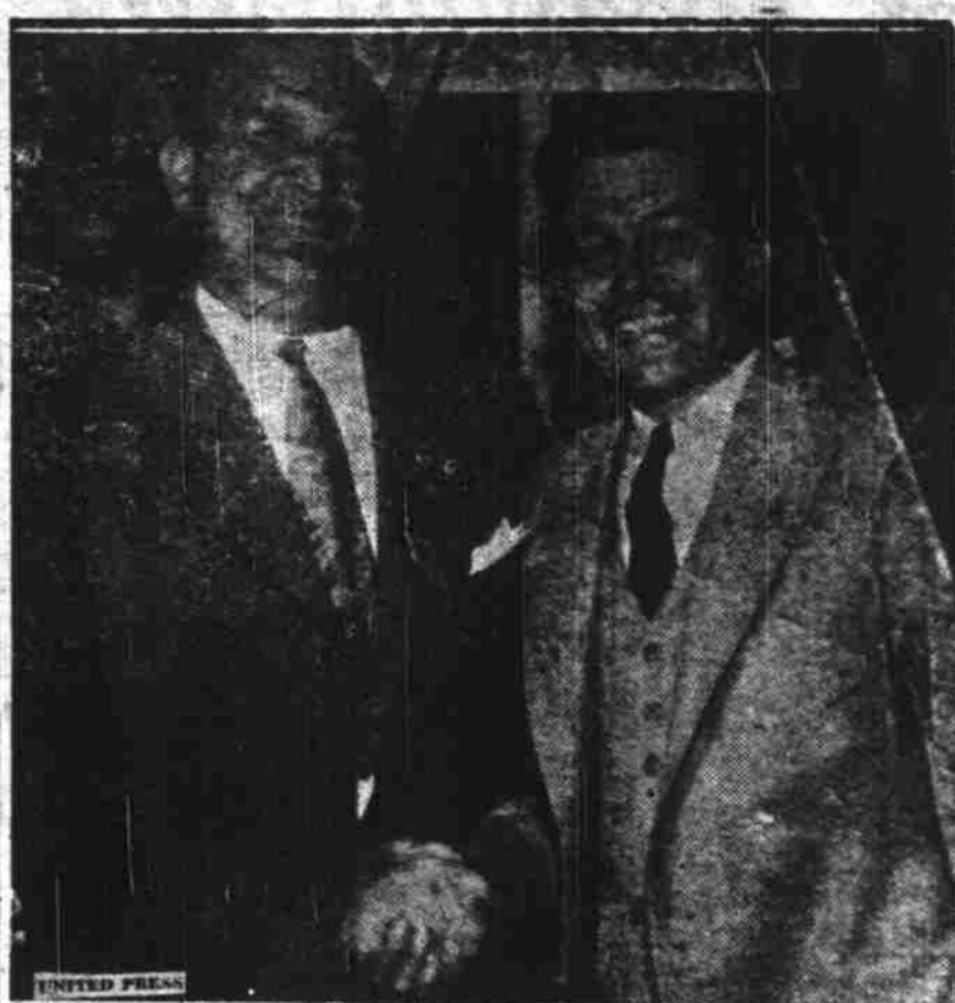
Above, left, is Louis A. Johnson, Clarkburg, W. Va., who was elected national commander of the American Legion at the annual convention at Portland. He is shown receiving congratulations from Retiring Commander Henry L. Stevens Jr. Johnson was elected on the first ballot.