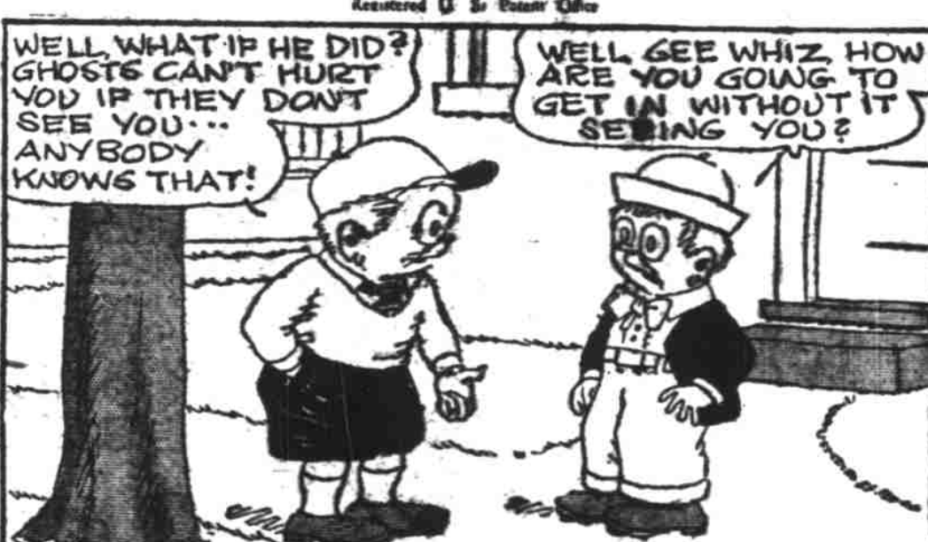
WELL, WHAT IF HE DID? GHOSTS CAN'T HURT YOU IF THEY DON'T SEE YOU... ANYBODY KNOWS THAT!