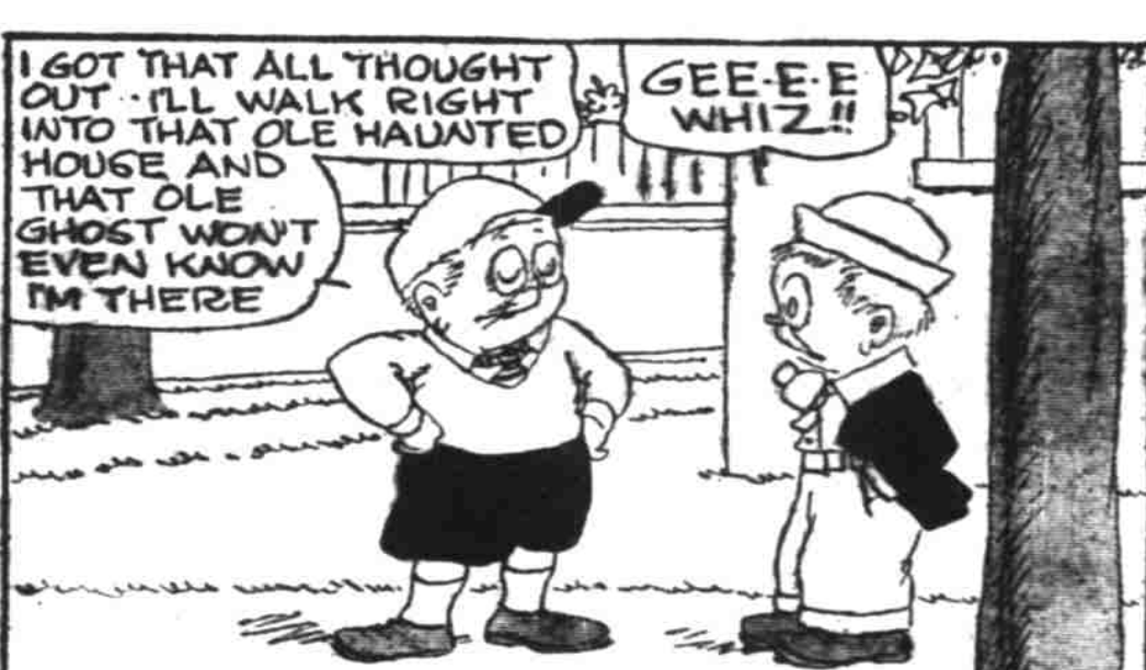
I GOT THAT ALL THOUGHT OUT - I'LL WALK RIGHT INTO THAT OLE HAUNTED HOUSE AND THAT OLE GHOST WOAN'T EVEN KNOW I'M THERE