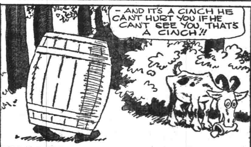
- AND IT'S A CINCH HE CAN'T HURT YOU IF HE CAN'T SEE YOU, THAT'S A CINCH!!