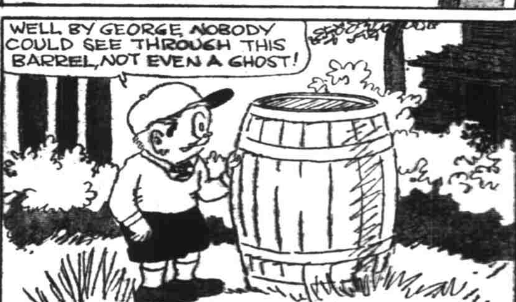
WELL, BY GEORGE, NOBODY COULD SEE THROUGH THIS BARREL, NOT EVEN A GHOST!