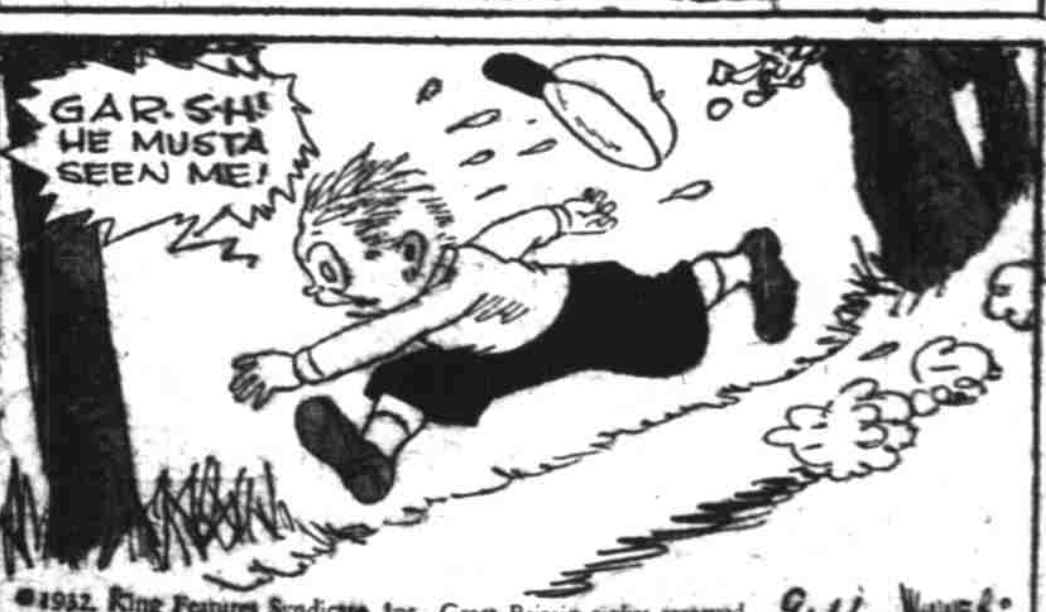
GAR - SH! HE MUSTA SEEN ME!

©1932, King Features Syndicate, Inc., Great Britain rights reserved. 9-11 Winner