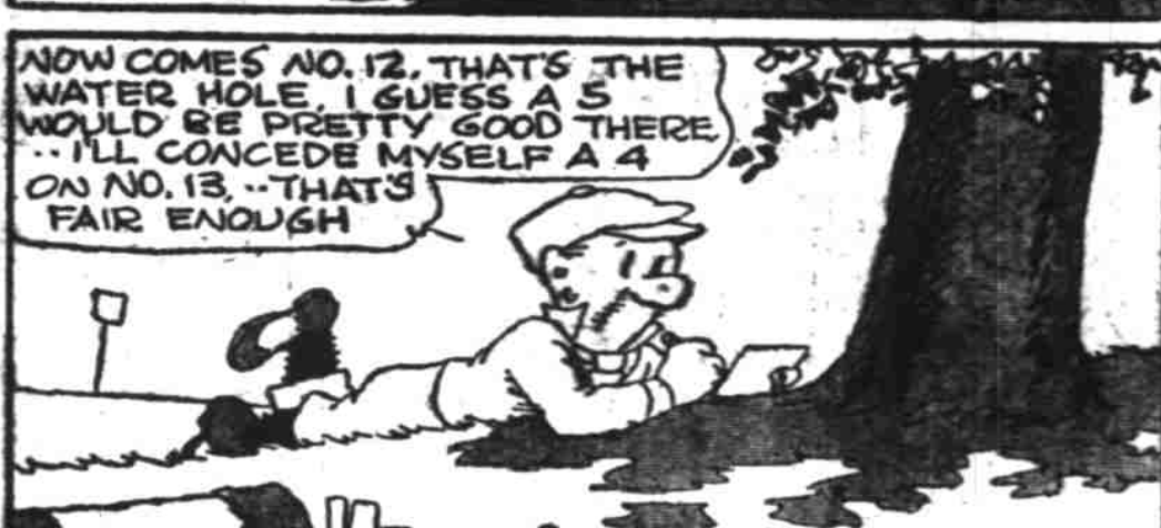
NOW COMES NO. 12. THAT'S THE WATER HOLE. I GUESS A 5 WOULD BE PRETTY GOOD THERE... I'LL CONCEDE MYSELF A 4 ON NO. 13. THAT'S FAIR ENOUGH