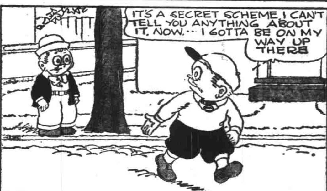
IT'S A SECRET SCHEME, I CAN'T TELL YOU ANYTHING ABOUT IT, NOW... I GOTTA BE ON MY WAY UP THERE