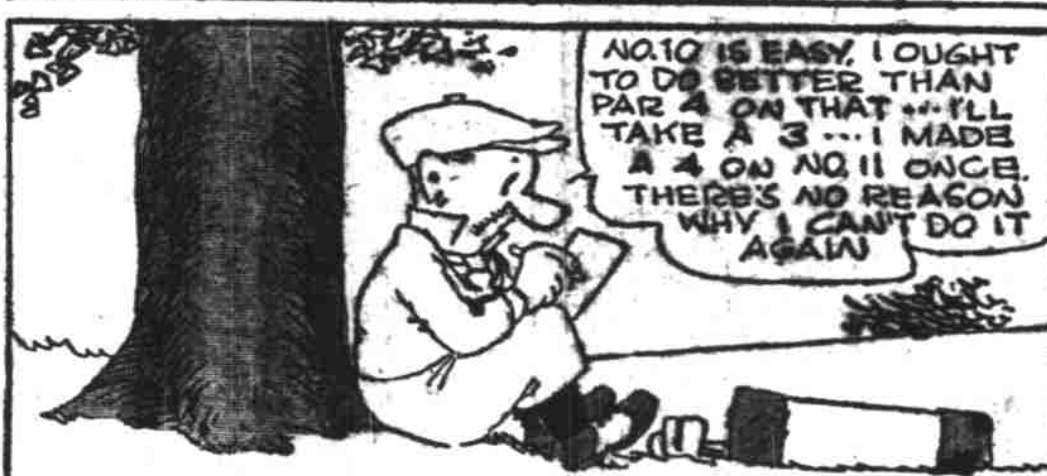
NO. 10 IS EASY. I OUGHT TO DO BETTER THAN PAR 4 ON THAT... I'LL TAKE A 3... I MADE A 4 ON NO. 11 ONCE. THERE'S NO REASON WHY I CAN'T DO IT AGAIN