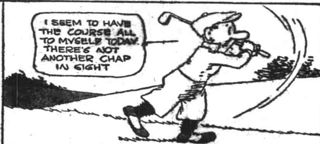
I SEEM TO HAVE THE COURSE ALL TO MYSELF TODAY. THERE'S NOT ANOTHER CHAP IN SIGHT