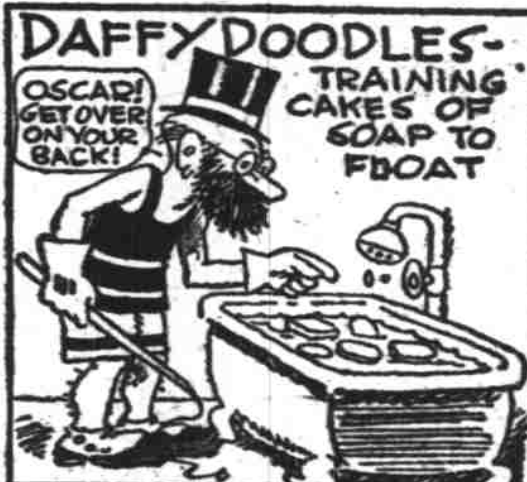
DAFFY DOODLES - TRAINING CAKES OF SOAP TO FLOAT OSCAR! GET OVER ON YOUR BACK!