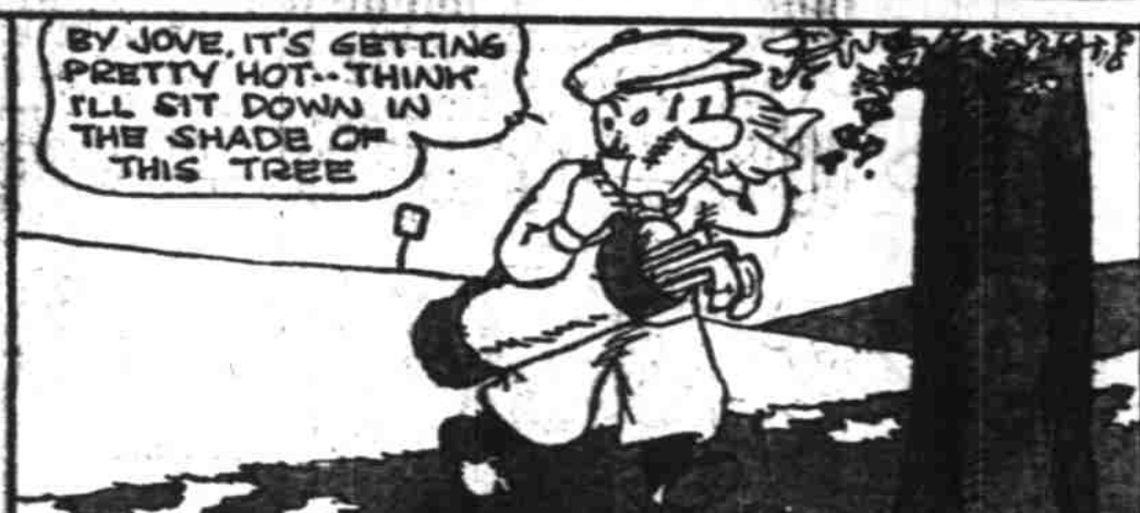
BY JOVE, IT'S GETTING PRETTY HOT. THINK I'LL SIT DOWN IN THE SHADE OF THIS TREE