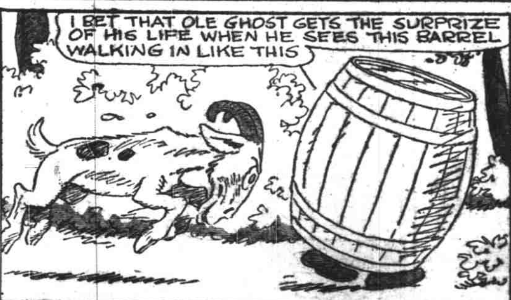
I BET THAT OLE GHOST GETS THE SURPRIZE OF HIS LIFE WHEN HE SEES THIS BARREL WALKING IN LIKE THIS