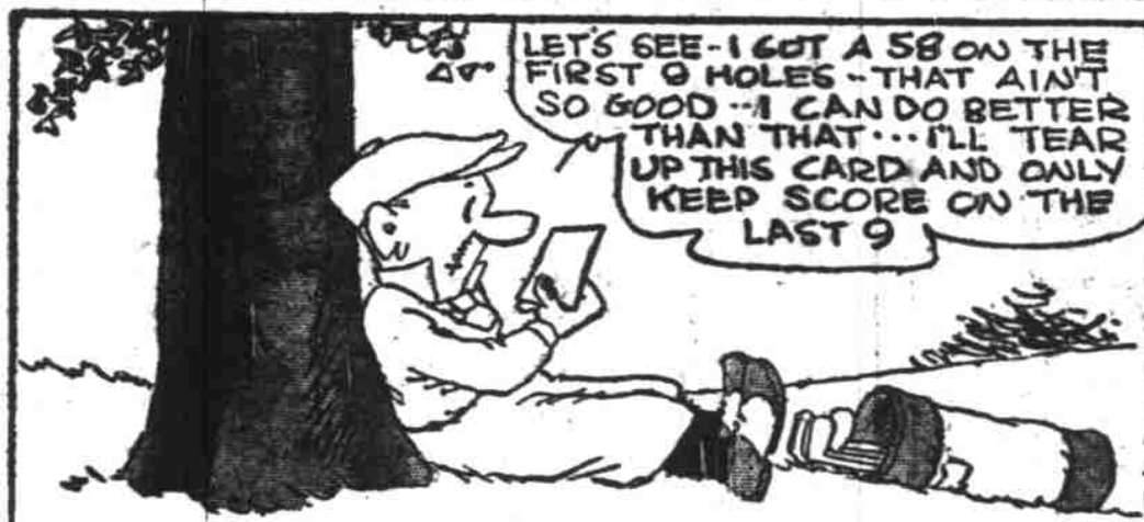
LET'S SEE - I GOT A 58 ON THE FIRST 9 HOLES - THAT AIN'T SO GOOD - I CAN DO BETTER THAN THAT... I'LL TEAR UP THIS CARD AND ONLY KEEP SCORE ON THE LAST 9