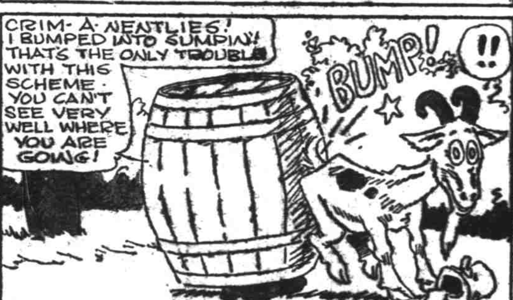
CRIM - A NENTLIES! I RUMPED INTO SUMPYAN! THAT'S THE ONLY TROUBLE WITH THIS SCHEME - YOU CAN'T SEE VERY WELL WHERE YOU ARE GOING!