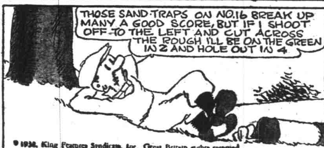
THOSE SAND-TRAPS ON NO. 16 BREAK UP MANY A GOOD SCORE, BUT IF I SHOOT OFF TO THE LEFT AND CUT ACROSS THE ROUGH I'LL BE ON THE GREEN IN 2 AND HOLE OUT IN 4