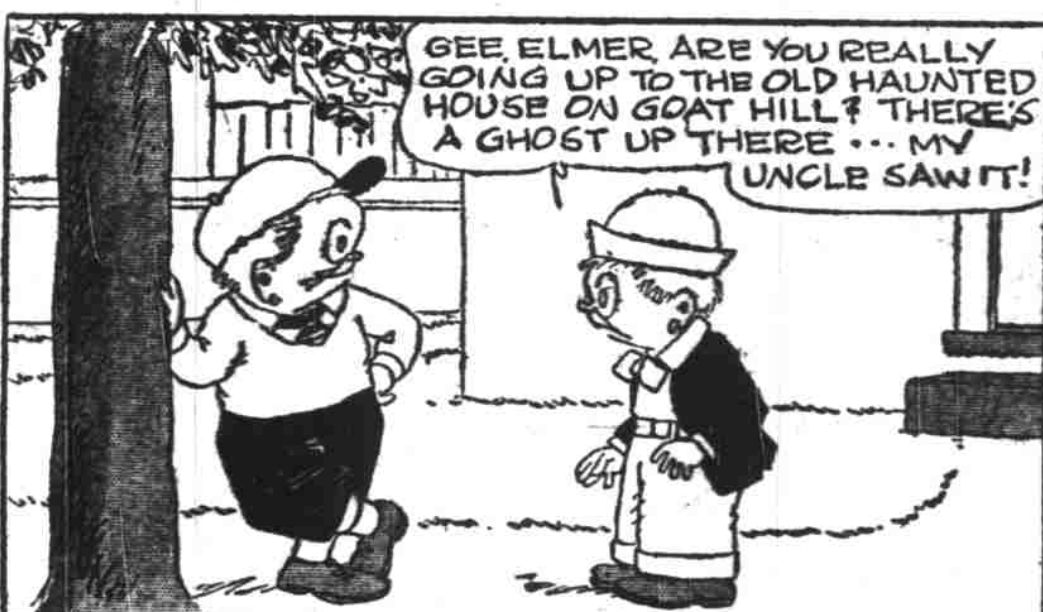
GEE, ELMER, ARE YOU REALLY GOING UP TO THE OLD HAUNTED HOUSE ON GOAT HILL? THERE'S A GHOST UP THERE... MY UNCLE SAW IT!