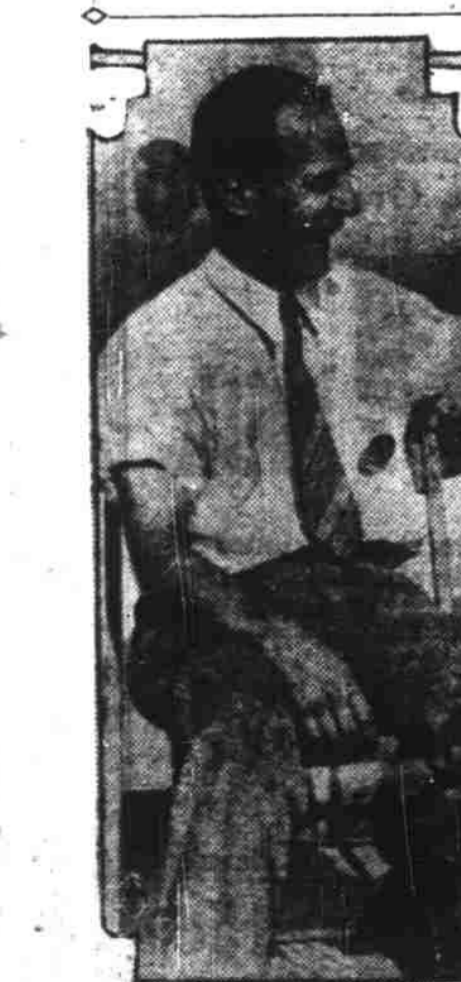
The pleased expression on Major Jimmy Doolittle's face has good reason for being there. The famous aviator is shown just after he had set a new world's record for land planes at the national air meet in Cleveland, O. Flying an 800 H.P. Gee Bee sports plane, Major Doolittle flashed over the course at 293.193 miles an hour.