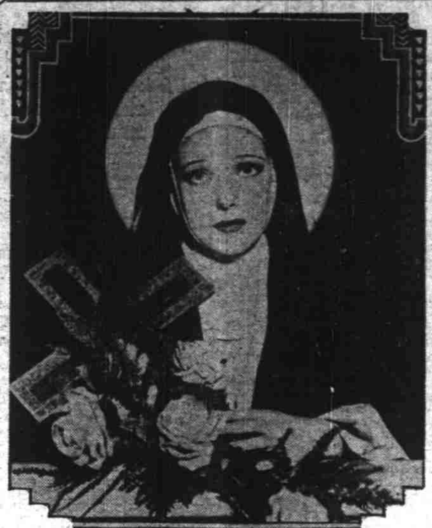
It was this pose that won for Loretta Young the coveted role of the nun in the film "The Miracle," Carl Vollmuller's famous play staged by Max Reinhardt. The picture will be done in color and Reinhardt has been asked to go to Hollywood from Germany to stage it.