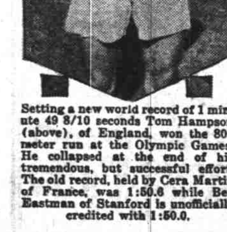
Setting a new world record of 1 minute 49 8/10 seconds Tom Hampson (above), of England, won the 800 meter run at the Olympic Games. He collapsed at the end of his tremendous, but successful effort. The old record, held by Cera Martin of France, was 1:50.6 which Ben Eastman of Stanford is unofficially credited with 1:50.0.