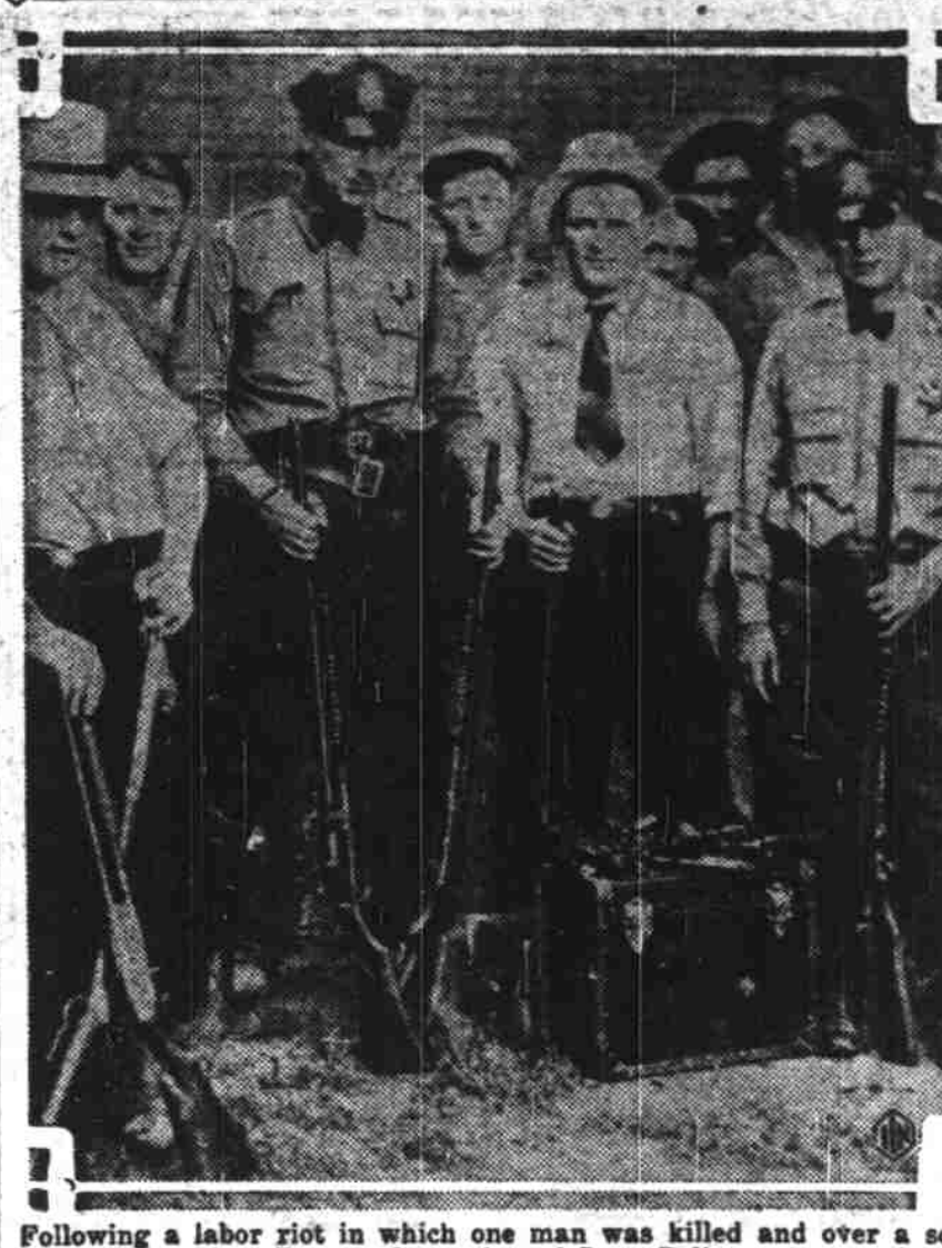
Following a labor riot in which one man was killed and over a score injured, these heavily armed guards and State Police are protecting the workers on the cofferdam being constructed on the Illinois River, near Marseilles, Ill. The labor union claims that the companies doing the work are paying far below union wages and that they are also importing cheap labor from other States, keeping union men out of work.