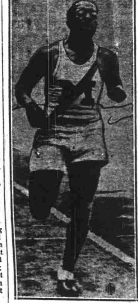
Eddie Tolan (above) of Detroit is looked upon as a sure point scorer for Uncle Sam in the 100- and 200-metre sprints at the Olympic Games. The former University of Michigan negro star finished second to Ralph Metcalfe in the tryouts in both events.