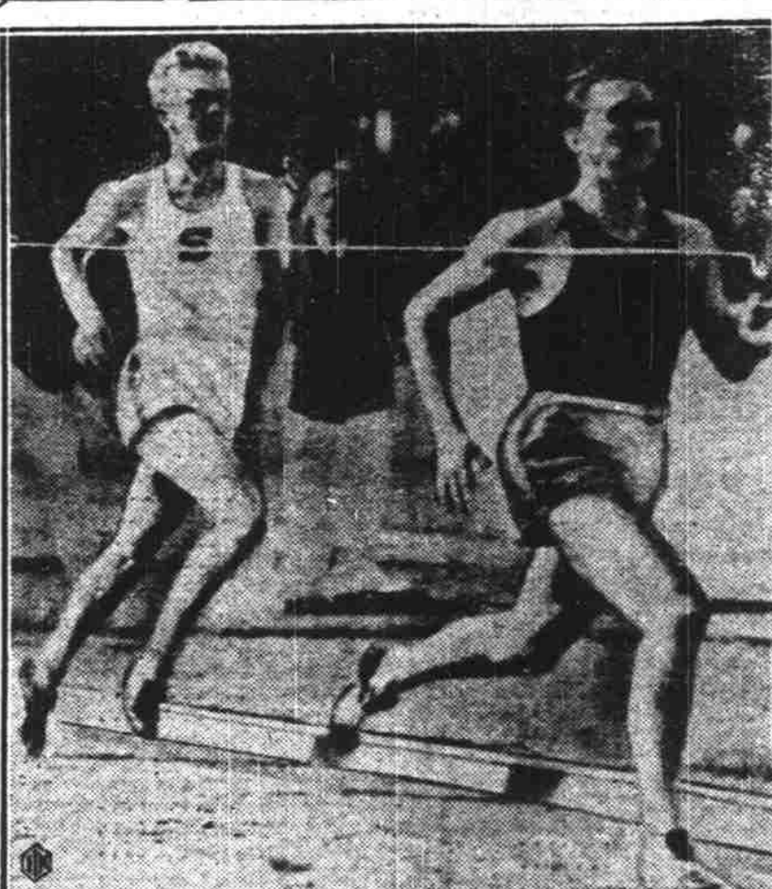
Here's Bill Carr, of Pennsylvania, breaking the tape to win the 400-meter event in the final of the American Olympic tryouts and national championships at Palo Alto, Cal. Carr set a world's record of 46.9 seconds for the event, proving that his victory in the I. C. 4A meet was not a fluke. Ben Eastman, the Stanford star quarter-miler, is shown finishing second.